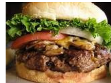
PHOTO GALLERY Metro Detroit's best burgers

Take a look back at the year that was in this chronological look at the biggest events and best photos.