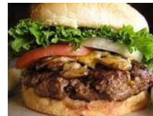
PHOTO GALLERY Metro Detroit's best burgers

Take a look back at the year that was in this chronological look at the biggest events and best photos.